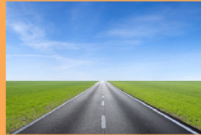
BLACK TOP ROAD